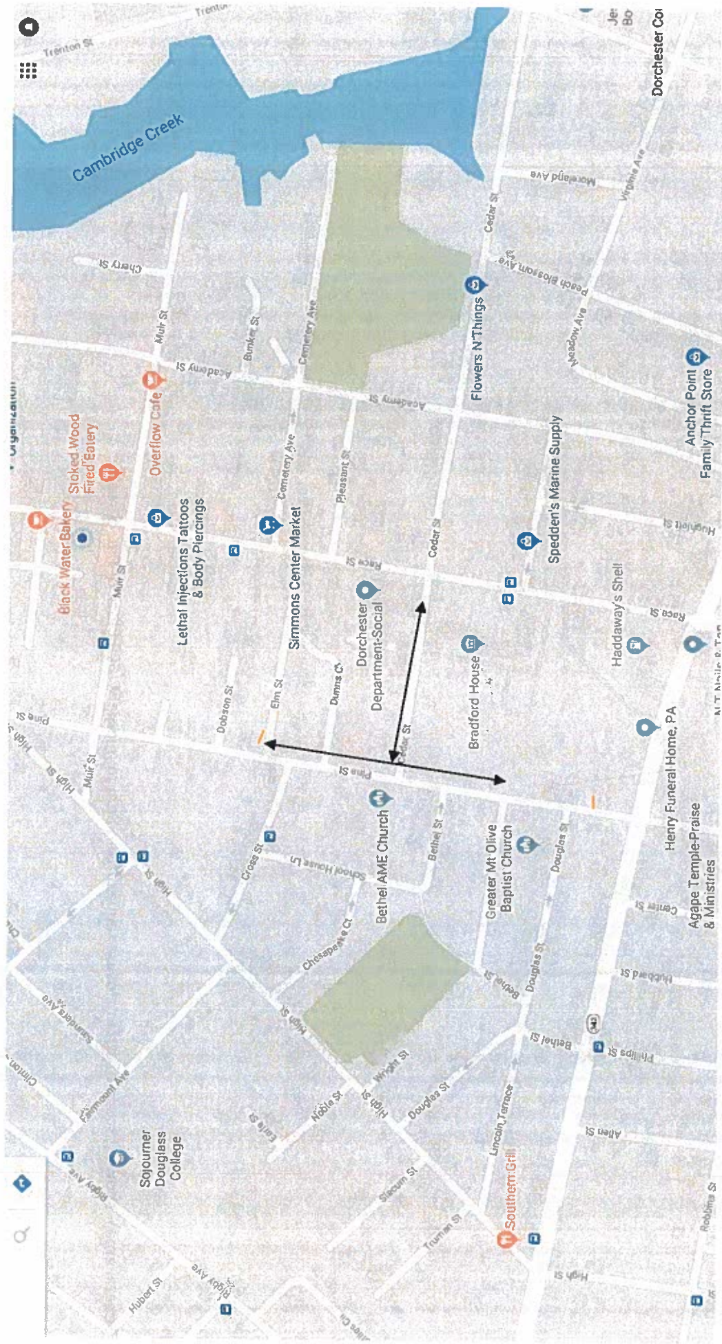
General area – showing scope of street closure request from 10 am to 8pm