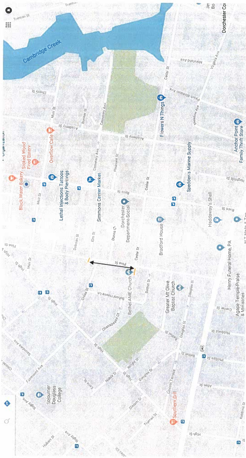
General area – showing scope of street closure request from 8pm to midnight (600 Block of Pine Street)