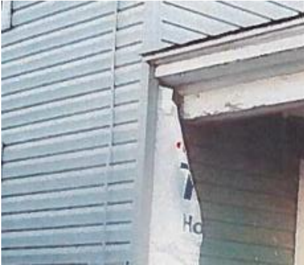
New Siding with Original Siding Exposed