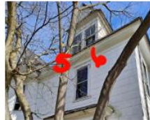
Right side elevation continued