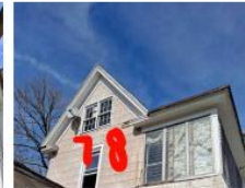
Back side elevat

The attic windows are the ONLY windows that are historic numbered 1-8 above. I would like to replace all windows mainly because they do not match the other 80% of the windows which we would call modern now. The windows are in obvious bad shape and it would not be worth it for me to restore, since I feel that the other 80% of the windows which are not historic take most of the visual eye of observers. I would like to replace these windows with American Craftsman double hung pane white Vinyl Windows, which I will have custom made to fit the size of windows in question. Please see below to get specs of window that will be replaced.