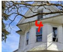
Right side elevation