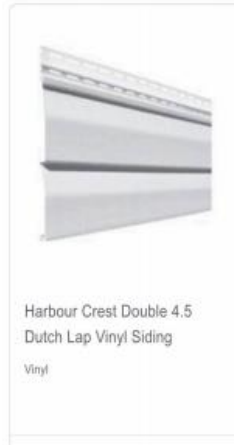
Harbour Crest Double 4.5 Dutch Lap Vinyl Siding Vinyl