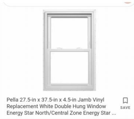
Pella 27.5-in x 37.5-in x 4.5-in Jamb Vinyl Replacement White Double Hung Window Energy Star North/Central Zone Energy Star ...

The attic windows are the ONLY windows that are historic numbered 1-8 above. I would like to replace all windows mainly because they do not match the other 80% of the windows which we would call modern now. The windows are in obvious bad shape and it would not be worth it for me to restore, since I feel that the other 80% of the windows which are not historic take most of the visual eye of observers. I would like to replace these windows with American Craftsman double hung pane white Vinyl Windows, which I will have custom made to fit the size of windows in question. Please see below to get specs of window that will be replaced.