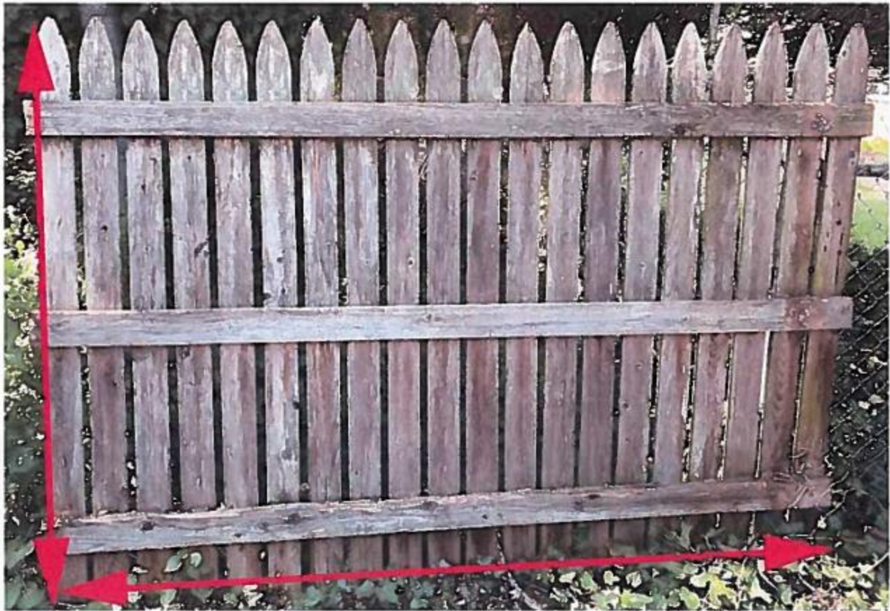
8' wide x 58" tall

This is a pic of one of the fence segments. They all pretty much look the same. I like them because they are not new, they have an aged patina that I think blends well with the neighborhood and what is already here.